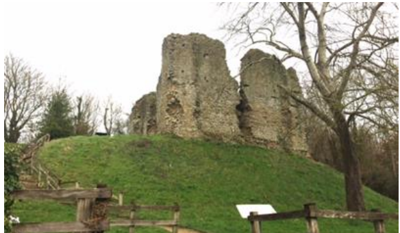
Sutton Valence Castle